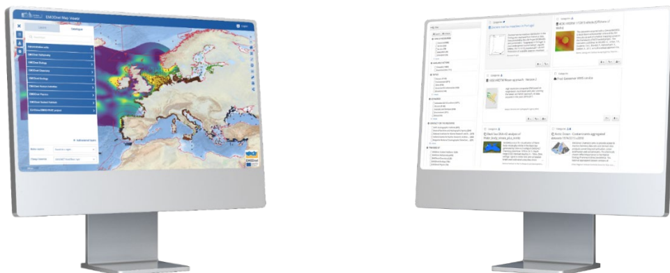
Figure 1. Illustration of the new common map viewer and central data catalogue

"The unified EMODnet data service is a game-changer for users of in situ marine data, allowing seamless cross-border, cross-thematic data retrieval at the level required by marine managers and policy makers, the blue economy and private sector, the scientific research community and more." says Andreea Strachinescu, Head of Unit at the European Commission DG MARE.